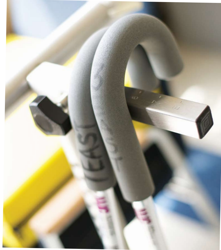
Medical advancements in knee replacement and reconstructive surgery are helping more patients reclaim independent and active lives than ever before.