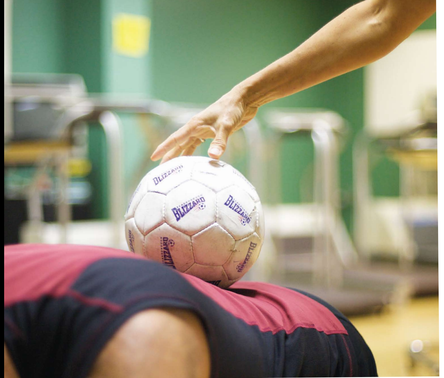
Rehabilitation programs at the Holland Orthopaedic & Arthritic Centre provide patients with highly specialized services and personalized care often unavailable in community settings.

As part of the busiest trauma centre in the country, the Holland MSK Program focuses on complex injuries that cannot be managed anywhere else. Our Holland Orthopaedic & Arthritic Centre is the largest centre for joint replacement surgery in Canada, where we treat the most severe cases using techniques developed by our own specialists. We are making surgery less painful; we are returning patients to their normal lives sooner than ever thought possible; and, we have substantially reduced surgical wait times.