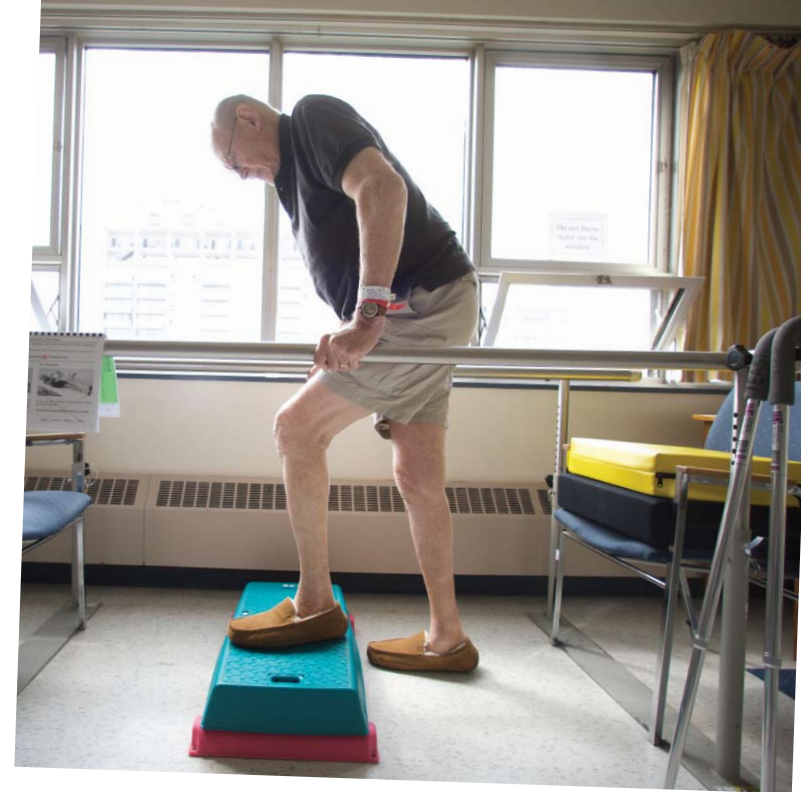
At Sunnybrook we invented a liquid solution that, once injected, stabilizes the vertebrae to provide immediate and lasting pain relief.