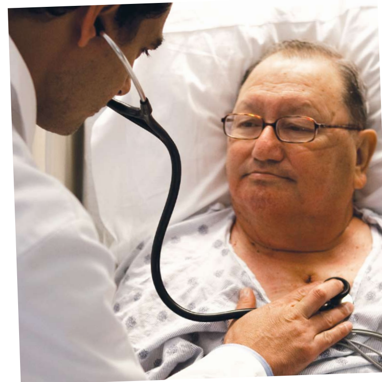
We're testing a new application for an old enzyme, used in conjunction with a tool we invented, to break through coronary blockages.