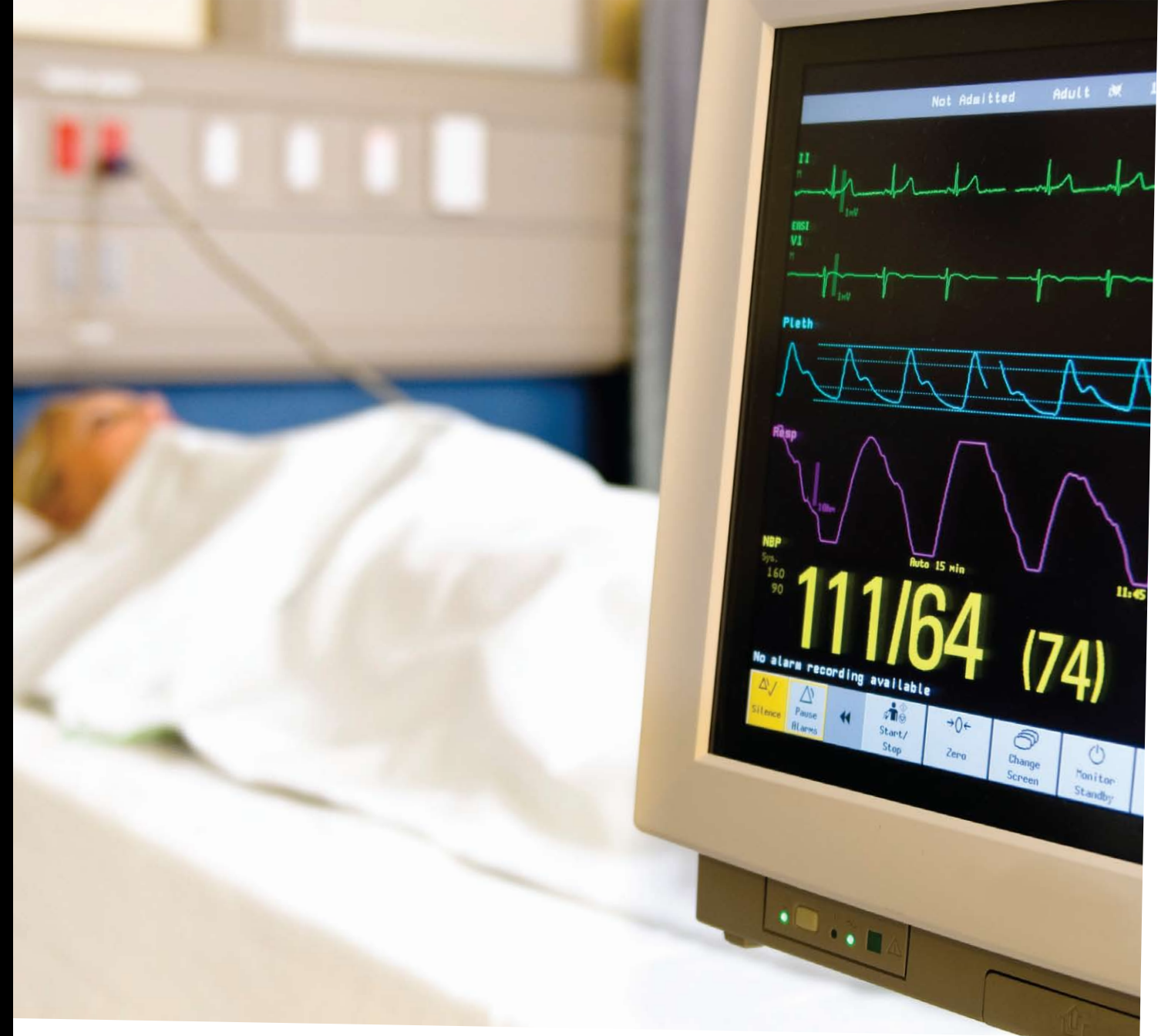
Patients’ vital signs are closely monitored in Sunnybrook’s Cardiovascular Surgery Unit, after their transfer from the Cardiac Intensive Care Unit (CICU).

The Schulich Heart Centre is an international leader in cardiovascular care. We bust blood clots, repair arteries, replace valves and right heart rhythms, using imaging technologies and tools we’ve invented in our own labs. Our patients are in the hands of world-renowned experts, backed by the most imaginative researchers in the country.