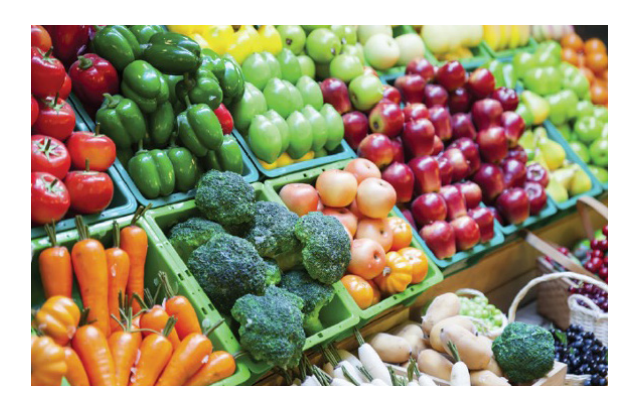
Eating healthy foods will help with your constipation