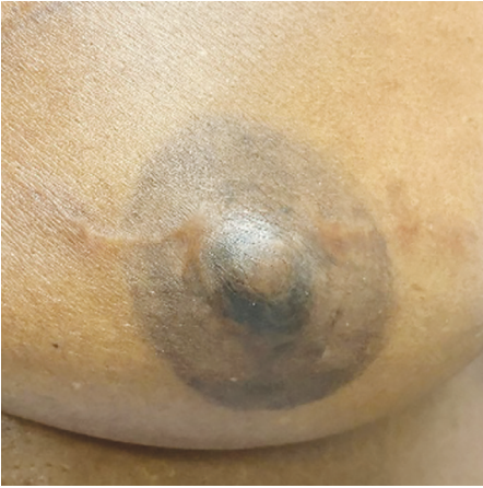
Local flap nipple reconstruction with healed tattoo