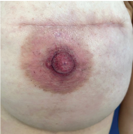
3D tattoo (permission to print given by Kyla from Cosmetic Transformations)