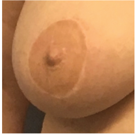
Local flap nipple reconstruction with healed tattoo