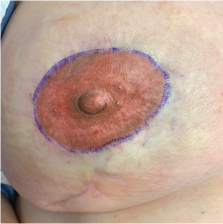
Local flap nipple reconstruction immediately after tattooing