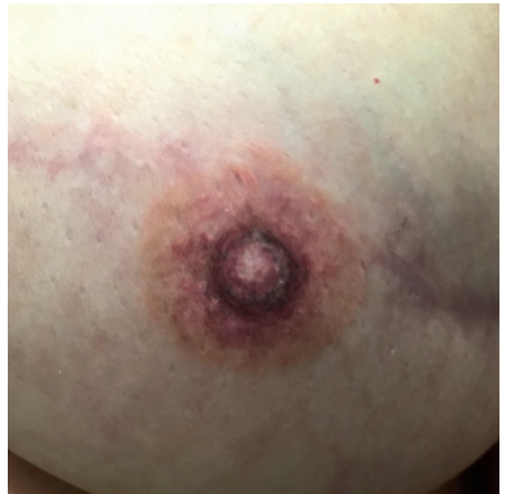
3D tattoo (permission to print given by Kyla from Cosmetic Transformations)