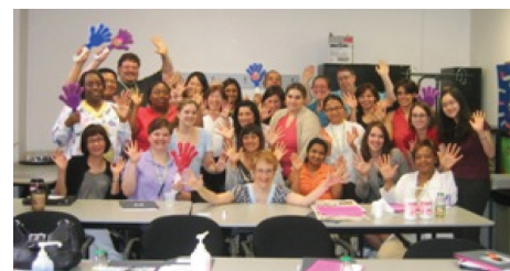
The hand hygiene roll-out to the rest of the organization is planned for later this fall.

The results were analyzed: B4 drove their hand hygiene compliance from 33 per cent to 52 per cent and D5 moved theirs from 45 per cent to 81 per cent. Clearly, both units tried very hard and the results were no small feat. The lunch took place October 20, 2008.